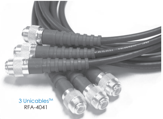
3 Unicable™ RFA-4041