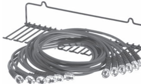
6 piece Unicable™ Kit with rack RFA-4040