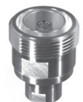
7-16 DIN Female PT-4000-120