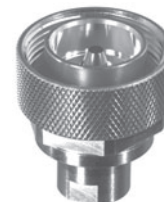
7-16 DIN Male PT-4000-119