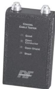
Unidapt™ Cable Tester RFA-4018-20